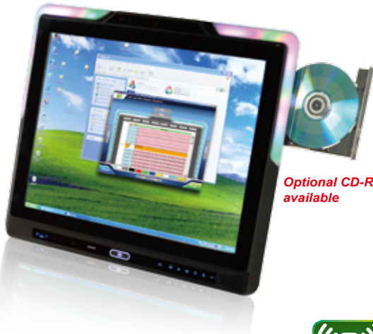
Optional CD-ROM available

Intel® Core™ i7/i5/i3 and Pentium® Processor