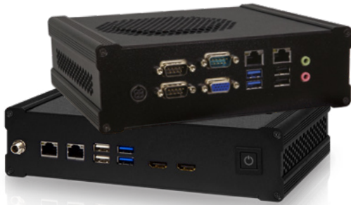
▼ BRICK Chassis with WAFER-AL (SBC not included)

Embedded Chassis for IEI DC input Mini-ITX/EPIC/3.5" SBC